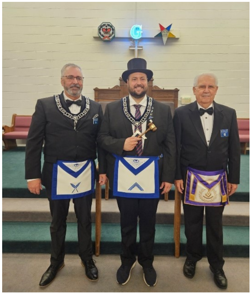
All officers installed for Riverside-Jett #112 and Zarthan Lodge #148. Congratulations to all.