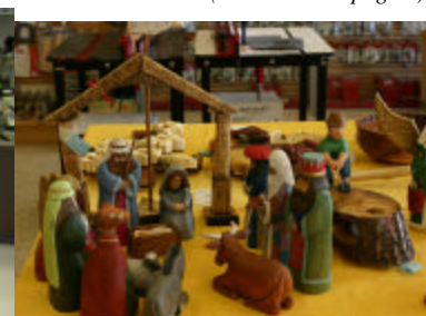
Above: Nativity carvings; see Page 2 for more show photos. Left: Pete Ward with Santa "go-bys"