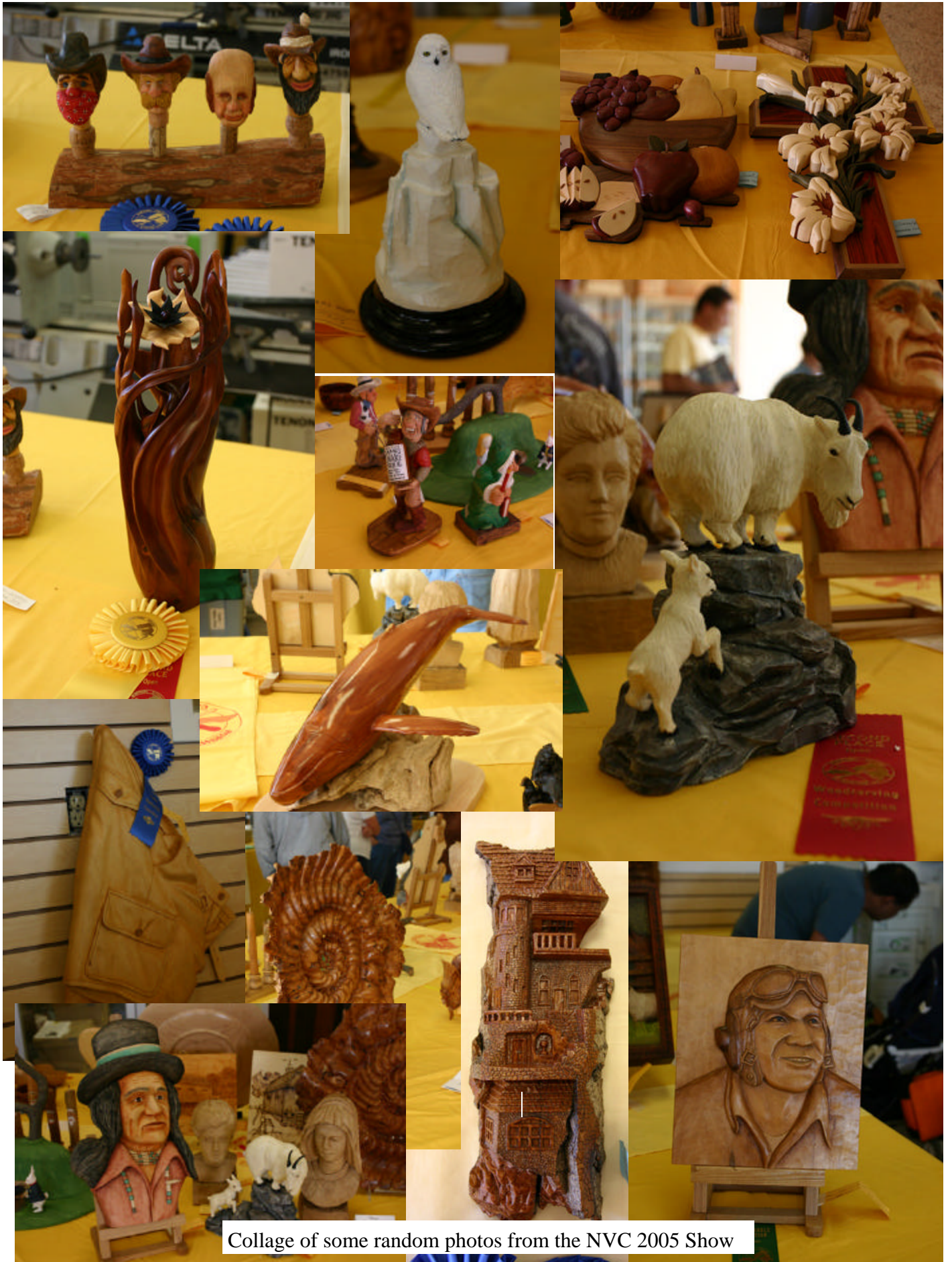
Collage of some random photos from the NVC 2005 Show