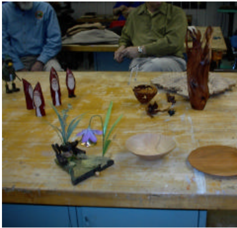
A few of the carvings at the April show