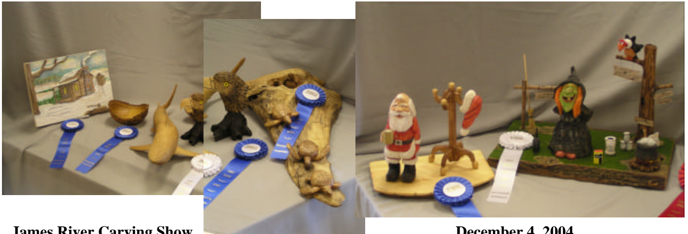
James River Carving Show

Members receiving the newsletter by email will be reminded individually if you have not renewed for 2005.