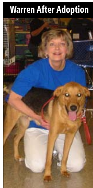
Warren After Adoption