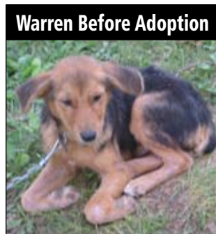
Warren Before Adoption

Warren: A lady placed a cruelty call about Warren. She said that Warren was tied up to a tree with no shelter and was left sitting out in the rain for several days. I went to check on him, and I found the cutest little German Shepherd mixed puppy with a terrible case of mange. I confronted the owners and asked why they had not taken him to a vet. The lady who lived at the house said that her son brought him home and she told him to take care of the puppy. One of the first things I noticed was that Warren had a docked tail, which is not normal for German Shepherds. I asked the lady, "What happened to this dog's tail?" She said her son put a rubber band around the tail to make it fall off. (The rubber band will cut off the circulation, causing the tail to fall off. This is very painful for the puppy.) Warren was scratching constantly because he had a terrible case of mange. He was also skinny. The lady had no desire to take care of him, so I convinced her to surrender Warren to me. I fell in love with him immediately. He was so sweet and so adorable. How could he be so neglected? Fortunately, Warren was adopted by a wonderful lady who adores him. He had a bad beginning that turned into a wonderful ending!!