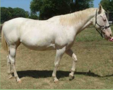
Applejacks Grade 10 year old mare