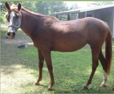
Tippy Grade 3 year old mare