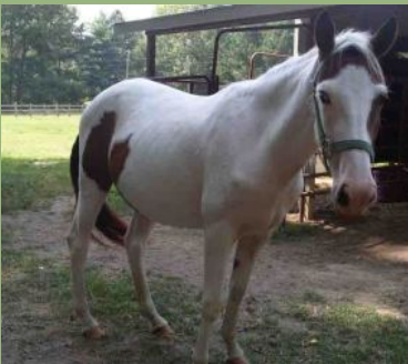
Sonoma Paint/Pinto 4 year old mare