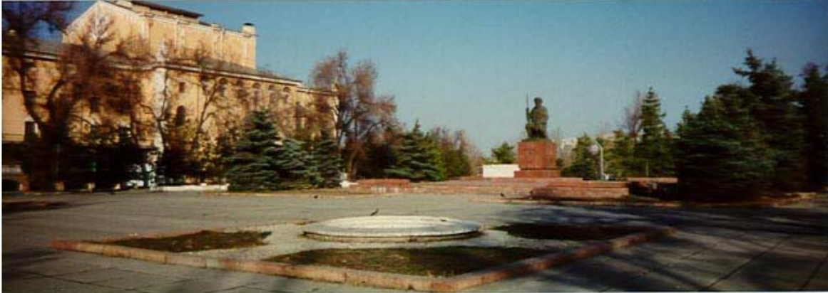
Great Kyrgyz akın Toktogul Satilganov

Today, Kyrgyz and Russian (since December 2001) are Kyrgyzstan's official languages and nearly 97 percent of the population is literate. At school, students can choose either a Russian or a Kyrgyz education. English introduces an attractive option for those interested in diplomacy and democracy. Kyrgyzstan's institutes of higher learning include the Kyrgyzstan Academy of Sciences, the Kyrgyz National State University, the Kyrgyz Slav University, Technical University, and many other institutions and academies.