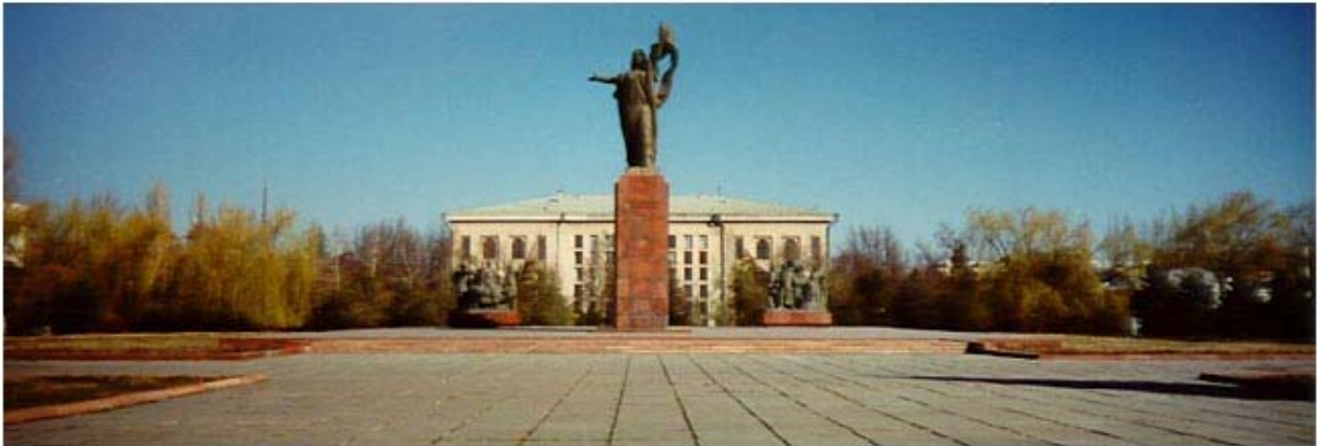
Memorial to revolutionary heroes of Kyrgyzstan

In the 1980's, the Soviet Union was heavily involved in Afghanistan. Much of the funds that, thus far, had been allotted to the agriculture and industry of the republics was funneled to the war front. Consequently, the republics were no longer receiving the subsidies that helped them manage their industries. Without the vital subsidies from Moscow, Kyrgyz industry began to decline.