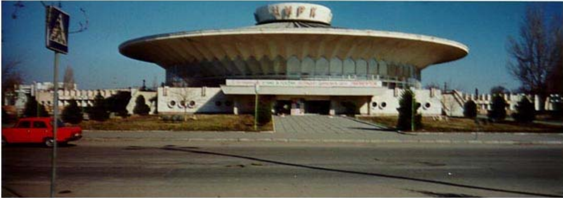
The circus in Bishkek

Kyrgyzstan gained its independence from the Soviet Union on August 31, 1991.