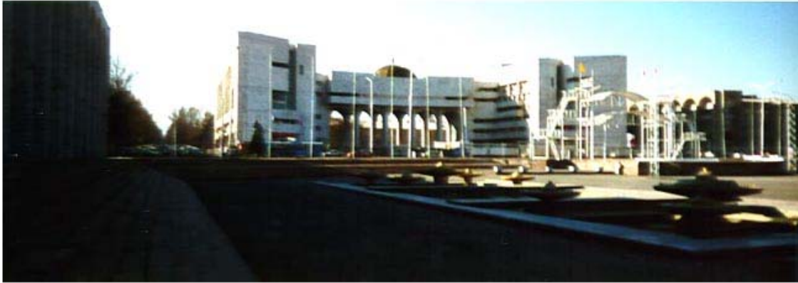
View of a corner of the main square in Bishkek

In the 1930's the Jadidist movement, which had begun much earlier and which sought Turkish unity and modernization of Islam, met with strong Soviet resistance. Things got even worse when, in 1937, after the completion of collectivization of Kyrgyz agriculture, all the manifestations of the Kyrgyz past were dissolved. Mosques and madrasahs masqueraded as museums and opera houses, while programs of sovietization and russification dominated Kyrgyz education. This was followed, in 1938, with the cold-blooded murder and collective entombment of some 137 Kyrgyz intellectuals, including the entire 1938 Supreme Soviet Central Committee. The famous Kyrgyz linguist Kasum Tynystavov, and Torokul Aitmatov, father of Chingiz Aitmatov , were among the dead.