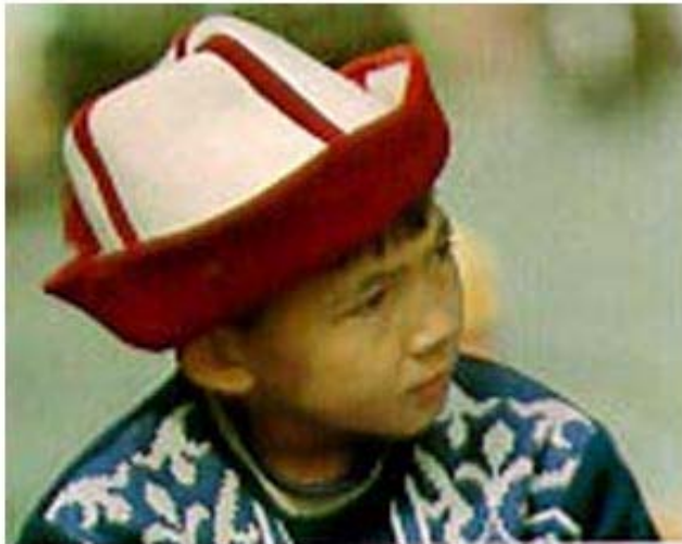
Kyrgyz boy in national costume

Today, led by Central Asia's only head of state that had not been a Soviet government official, Askar Akayev (elected first in 1990 and retained through the present time), the republic has established a democratic government (Constitution in place in 1994; parliament elected in 1995) and a market economy. Early on in his administration, Akayev used to meet with Kyrgyz intellectuals weekly and incorporate their concerns and ideas into the government plans. That democratic process, however, proved to be too open and was subsequently abandoned.