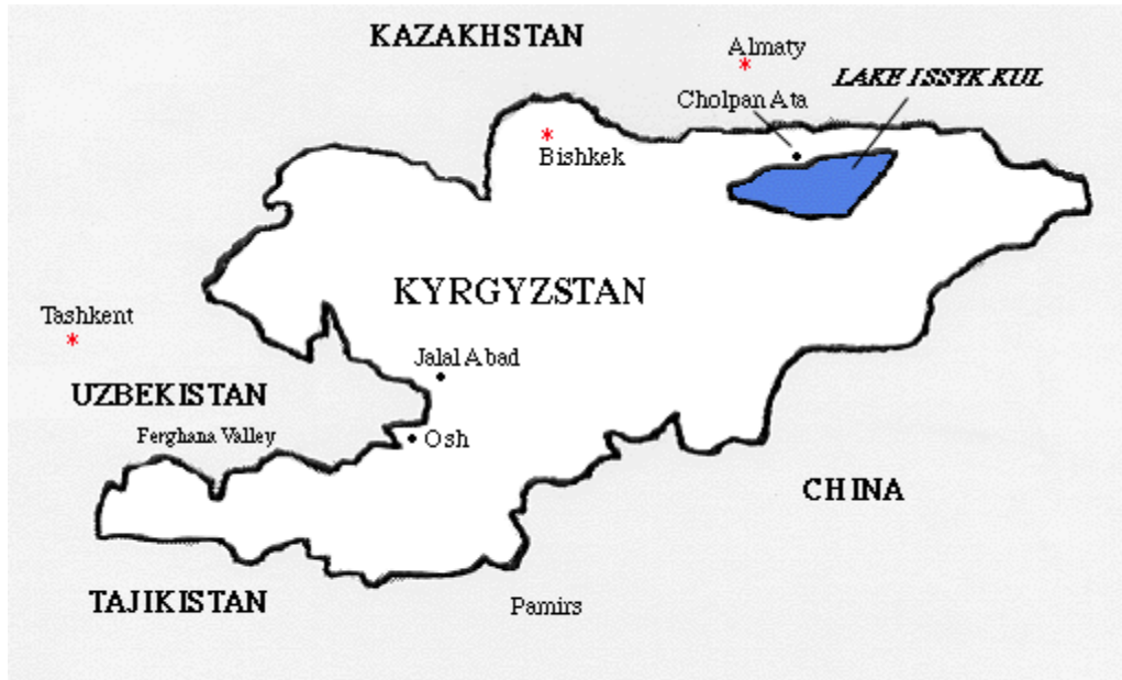
Map of the Republic of Kyrgyzstan