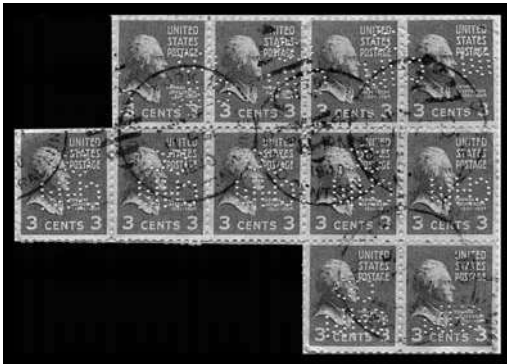
Front of Block of 11 (Reduced to 60% of actual size)

A common but interesting interest item it is! A cursory look at any blocks of perfin that you may possess might give the collecting community more interesting information. Hurry up and get out that box of perfins and take another look!