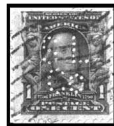
Stamp Cropped from Card (Shown 120% of Actual Size for Clarity)