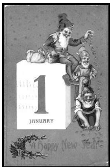
Colorful Front of New Year's Greeting Card

A search of the World Wide Web shows that S. Langsdorf & Co. were publishers of picture postcards on a very wide range of subjects starting in the early 1900's. (It appears they are not in business today.) Their cards are highly prized by postcard collectors, with many of them listed in the popular Internet auctions.