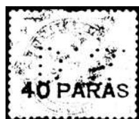
Pattern: DS (Front)