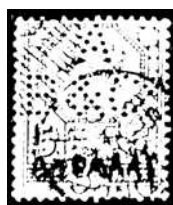
Pattern: A/B&Co (London Cancel)