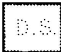
Pattern: DS (Back)