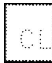
Pattern: CL (From Scheper's Catalog - CL 19a) (London Cancel)