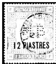
Pattern: MB (Front) (Lombardy, Italy (?) Cancel)