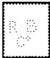
Pattern: RB/C (Back)