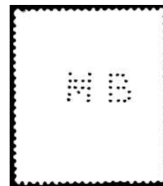
Pattern: MB (Back)