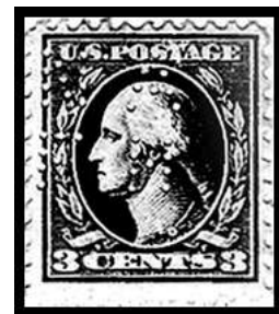
Figure 2 Stamp cropped from cover (135% of actual size for clarity)