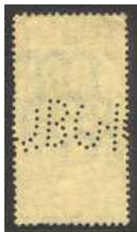
Figure 16: Perfin OVON.

Also the perfin . O L S Uch (fig. 15) is found in tax-stamps of the town of Warsaw. I suppose that one character is missing in the illustrated perfin. Is anyone in possession of a stamp with the first part of this perfin ?