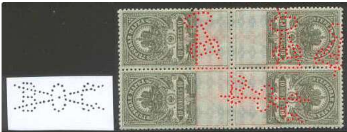
Figure 20: Perfin V O S (type 2) – reduced illustration

The perfin V O S (fig 19/20) is found in two types. Type 1 has 3 letters close together and there are no perfin holes in between the letters. Type 2 (see fig. 20) shows more space between the letters and also parts of perforated crosslines are visible in between the letters. The perfin V O S (type 1) I have on tax-stamps of 1887/ 1888. The perfin was used by the court of justice of the Vologda district.