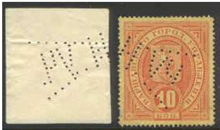
Figure 14: Perfin . . N Uch.

In view of the position of the letter “N” in between the crossing lines of the perfin . . N Uch (fig. 14), it looks like only two characters of this perfin are missing. This perfin is also found on municipal tax stamps of Warsaw.