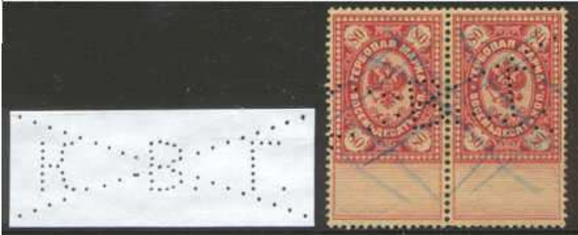
Figure 9: Perfin K.V.G.

The perfin K.V.G. is until now the only Russian perfin in revenues ending with the letter G. This perfin may have been used by an organ of the Russian province (Gubernya)? I have seen this perfin on tax stamps issued in 1887 and 1907.