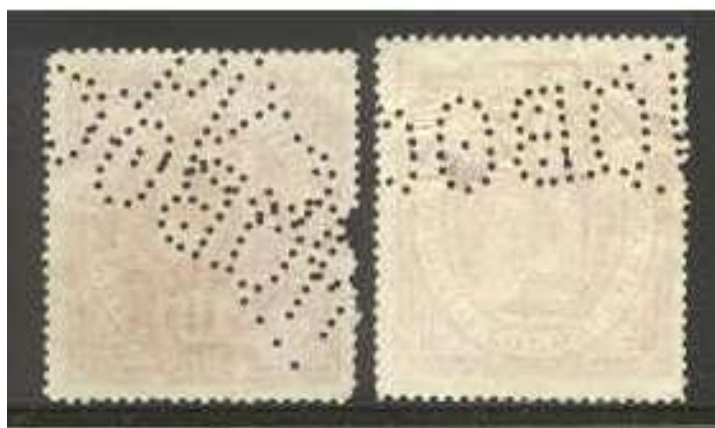
Figure 13: Perfin N O V O S Uch.

The perfin M O K Uch is likely to have been used by a registration office of a district organization in the Polish town of Warsaw. I have this perfin both in common Russian tax-stamps (1887) and in stamps for municipal taxes of Warsaw. For the time being I assume that the letter “O” stands for Okrug (district) and the “K” for Kontora (office).