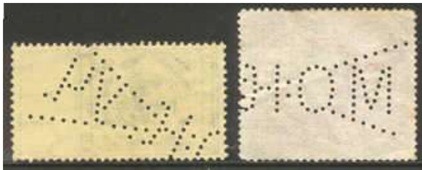
Figure 12: Perfin M O K Uch.

The perfin M O K Uch is likely to have been used by a registration office of a district organization in the Polish town of Warsaw. I have this perfin both in common Russian tax-stamps (1887) and in stamps for municipal taxes of Warsaw. For the time being I assume that the letter “O” stands for Okrug (district) and the “K” for Kontora (office).