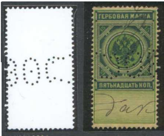
Fig. 19: Perfin V O S (type 1)

The perfin S O B O . . . (fig. 18) I have only found on a 10 kopeks tax-stamp of Warsaw. The two lines cross exactly in the middle of the second letter “O” so it is nearly certain that 3 characters of the illustrated perfin are missing. -Does anyone have a perfin with the remaining characters ?