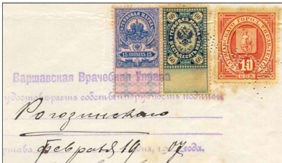
Fig. 22: part of a document with the perfin VRACH UPR. of the Medical Administration in Warsaw. (reduced illustration)

The perfin VRACH UPR. (figure 21) was used by the Medical Administration in Warsaw. The perfin is found in general Russian tax-stamps as well as in stamps for municipal taxes of Warsaw.