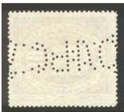
Figure 15: Perfin . O L S Uch.