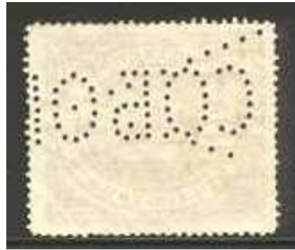
Figure 18: Perfin S O B O . . .

The perfin S O B O . . . (fig. 18) I have only found on a 10 kopeks tax-stamp of Warsaw. The two lines cross exactly in the middle of the second letter “O” so it is nearly certain that 3 characters of the illustrated perfin are missing. -Does anyone have a perfin with the remaining characters ?