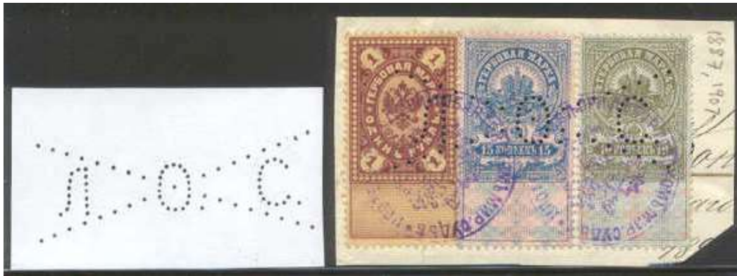
Figure 11: Perfin L.O.S.