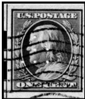
Figure 2. Enlargement of stamp in Figure 1.

Figure 1 was the first post card I obtained, and on examination I determined that the Schermack pattern was 1-3-4 (Figure 2)