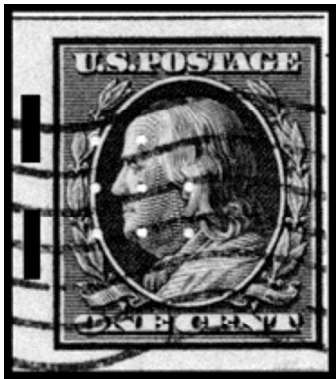
Figure 4. Enlargment of stamp from card in Fig. 3

As noted in the catalog supplemental information, 90-28 could be a 90-3 with two pins missing. Most likely the pins broke off during that period, but,