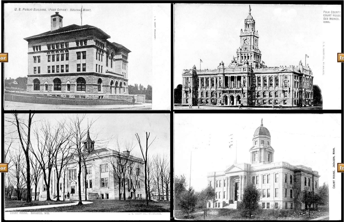
Figure 2. Here are some of the beautiful postcards sent. All seem to be substantial buildings mainly in the Midwest part of the country.

Below is a listing of the various buildings on the postcards that I have in my collection. Can anyone