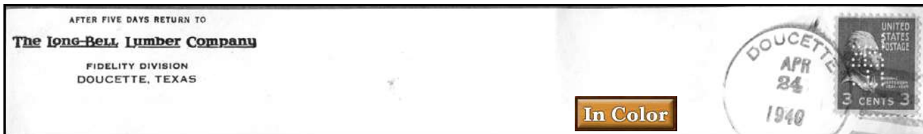
L47.5 [C+] is The Long-Bell Lumber Company of Doucette, Texas, showing also a later date of usage than is listed in the catalog.