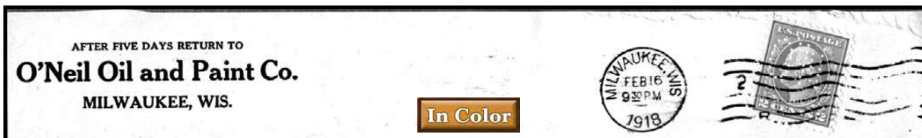
O51 [B] is the O'Neil Oil and Paint Co. of Milwaukee, Wisconsin.