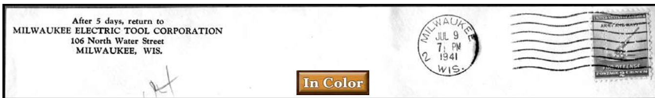
M105 [B] is the Milwaukee Electric Tool Corporation of Milwaukee, Wisconsin.