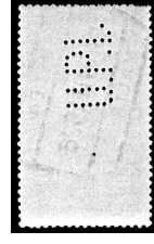
V18 Possible New type