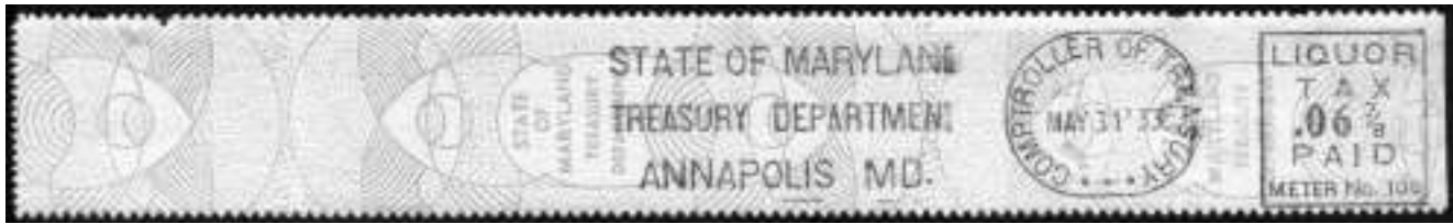
Maryland meter with Comptroller of the Treasury Identification, perhaps a trial us

reported on the meters, well in advance of the end of Prohibition, December 5, 1933, when public liquor sales could begin. The conclusion that these are sample, trial impressions is further supported by the next earliest reported date of use, December 5, 1933.