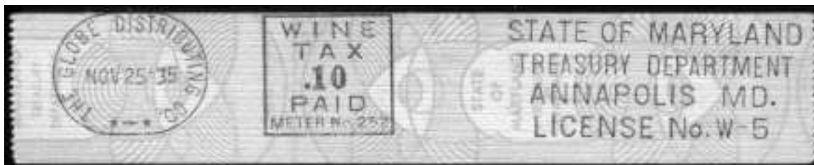
A Maryland wine meter, MD W4, with the identification of Wholesaler Number 5. Obviously the distilled spirits and wine meters have the potential for yielding identifications.