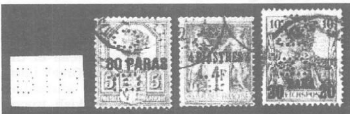
Figure 1. Levant stamps of Great Britain, France and Germany, all with perfin BIO of the Imperial Ottoman Bank in Constantinople

In these foreign offices special 'Levant stamps' were used for mail addressed abroad. These were ordinary GB, German, French, etc. stamps, but for