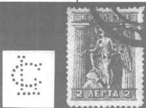
Figure 4. Greek Levant perfin CL

Thus Smyrna was, from 15 May 1919 until 8 September 1922, a part of Greek territory. First a