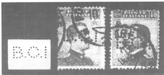
Figure 2. Italian Levant stamps with perfin B.C.I. of the Constantinople branch of Banca Commerciale Italiana.

On board 'H.M.S. Agamemnon' the Allies signed an armistice with Turkey on 30 October 1918. The Ottoman Empire was divided between the Allies of the Entente into spheres of influence, with Constantinople coming under International Control. The city of Constantinople was occupied by the Allied Forces of France, Great Britain and Italy on November 12th, 1918. These forces opened offices for military mail but soon these offices were opened to civilian mail as well. While special 'Levant stamps' weren't available, they first used ordinary stamps of the country concerned. These Levant stamps without overprint in Ottoman currency can only be rec-