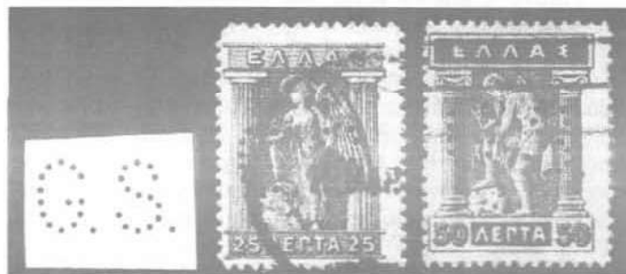
Figure 6. Greek stamps with perfin G.S. of Greek firm in Smyrna

Figure 5 shows this perfin in a Turkish stamp