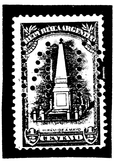
Bulletin No.313 (August 2001) Page 4