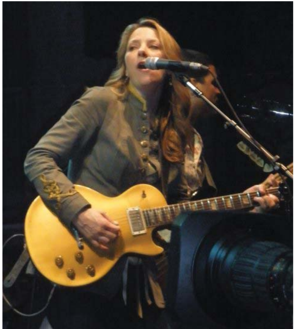
Susan Tedeschi Trucks

as well. "Dreams" opened up the set with a bang and featured Derek's incredible solo which I videotaped and uploaded to YouTube (link on page