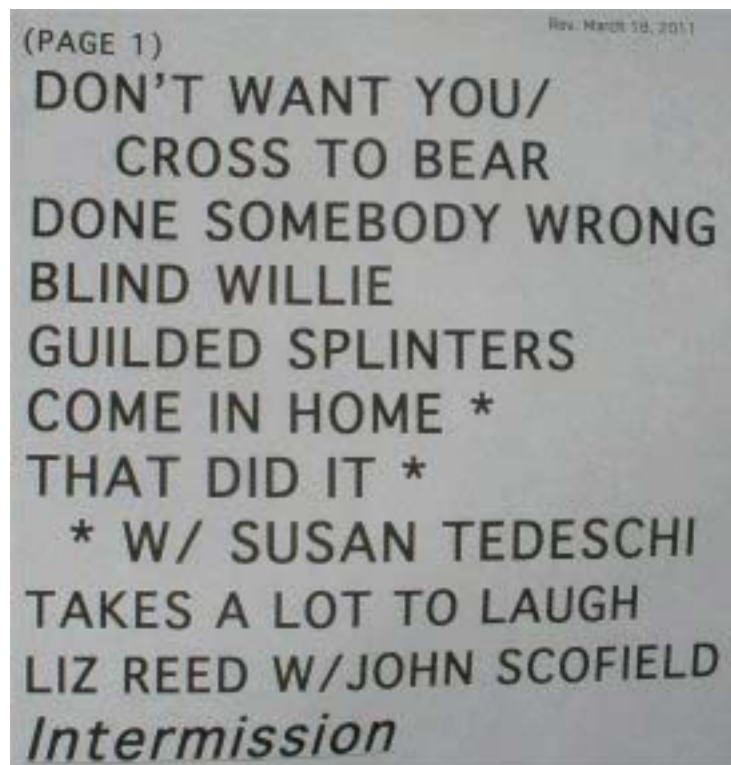
Setlist for First Set

http://www.youtube.com/watch?v=FZaH4h6eYrQ