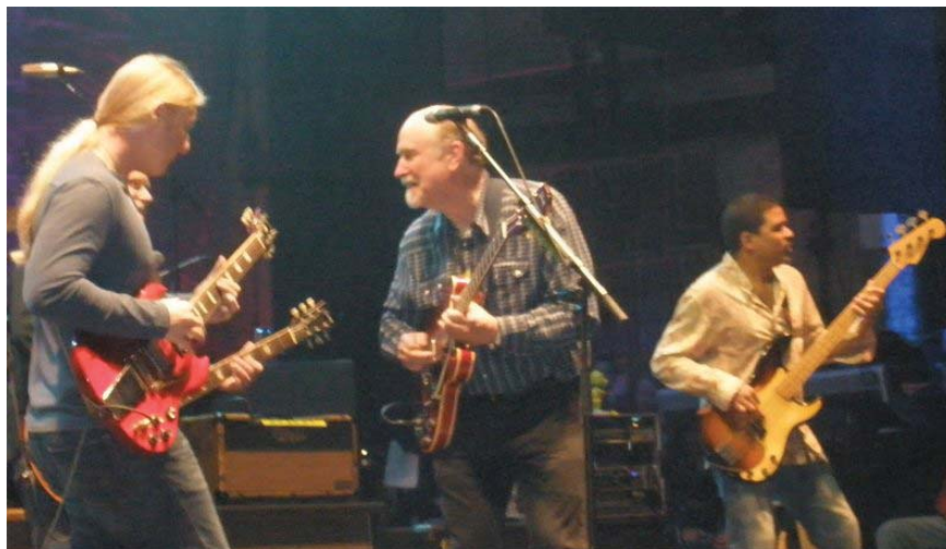
Derek Trucks, John Scofield, and Oteil Burbridge

founder member Greg Allman (pictured page 3). He is one of 3 original