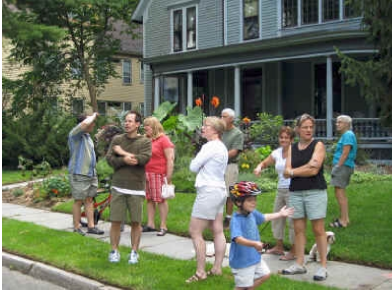
The Kenyon Street Garden Walk folks trade secrets and plants.