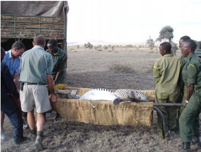
Figure 10: Loading the Grevy's zebra onto the canter