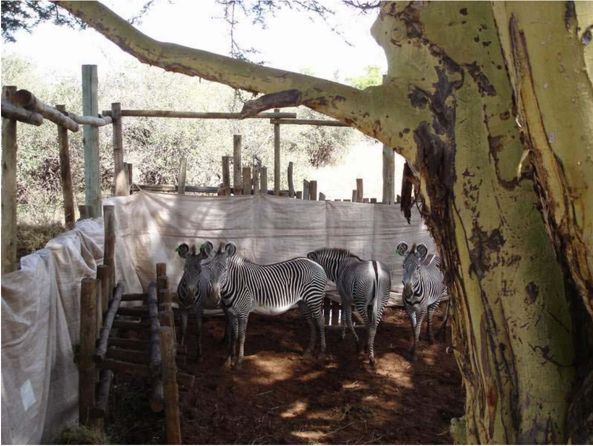
Figure 7: Holding pens