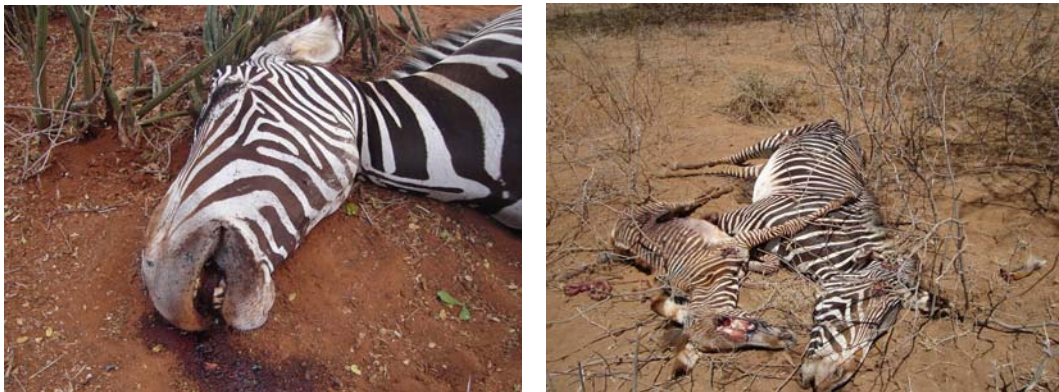
Figure 2-4: Grevy's zebra carcasses (2 and 4 clearly show the clinical signs of anthrax)