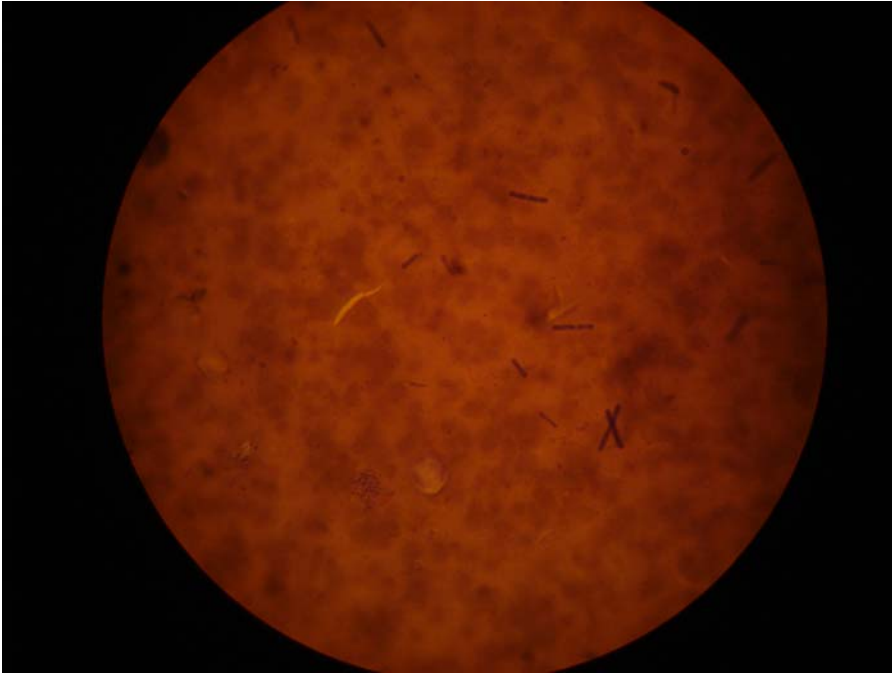
Figure 5: Results of a blood sample taken from a Grevy's zebra foal showing Bacillus anthracis