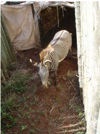
Figure 11: Off-loading the Grevy's zebra into the holding pens