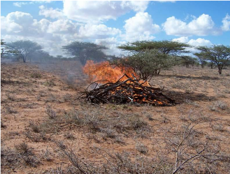
Figure 6: Burning of carcasses