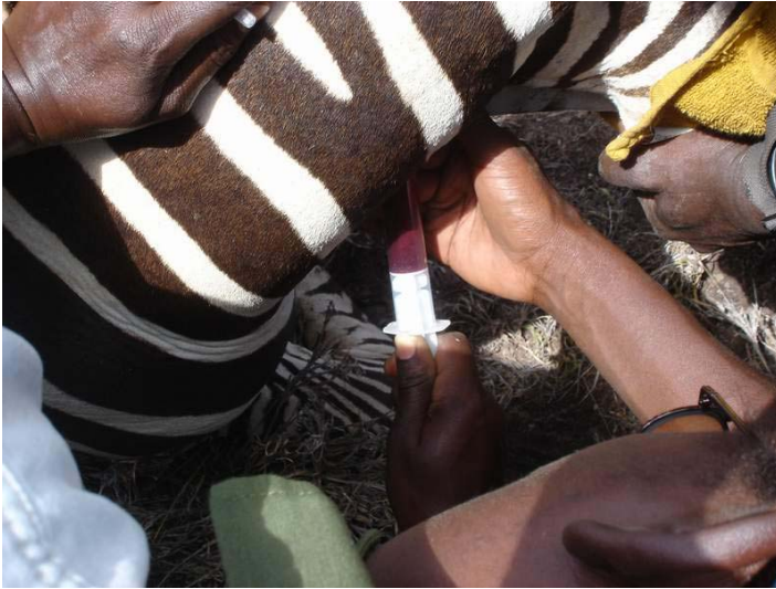
Figure 9: Drawing blood