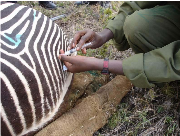
Figure 8: Delivering the Blanthrax® vaccine