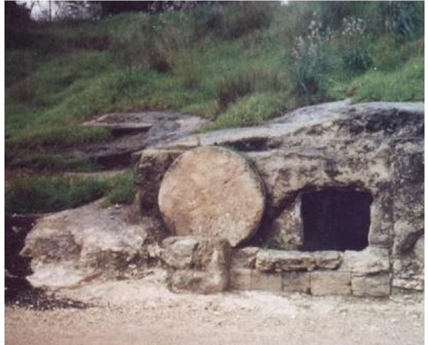
Site of Jesus' burial, now empty! We ask that you try to find Him !!!

This is the greatest news for all people. Jesus had once met with a prominent Pharisee named Nicodemus and told him that "God so loved the world that he gave His only Son, so that whoever believes in Him will not perish but have everlasting life." Jesus had also proclaimed, "I am the way, the truth and the life, no one comes to the Father but by me". Isn't that great NEWS? Believe (trust, put your faith) in Jesus Christ and be saved from your sin. Today is the day of salvation.