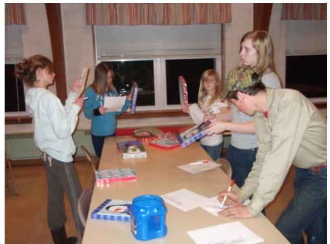
Youth Group Christmas Party