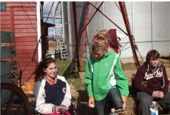
Trip to the Raub Farm corn maze

Two teams faced off in a lively balloon game. Looks like they could have used shin guards!