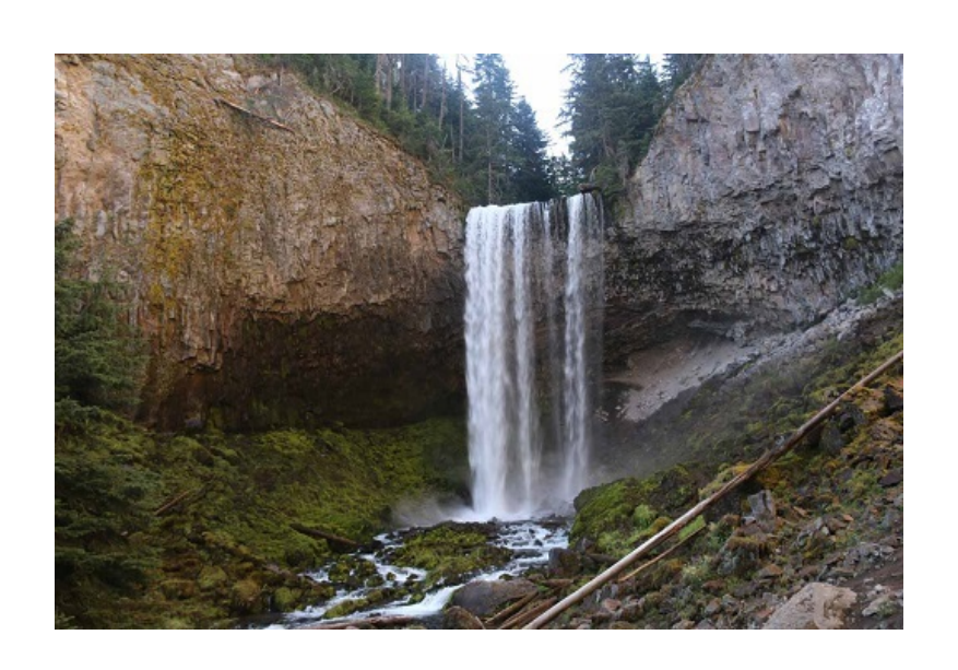
Mieke's Voice - Episode 50