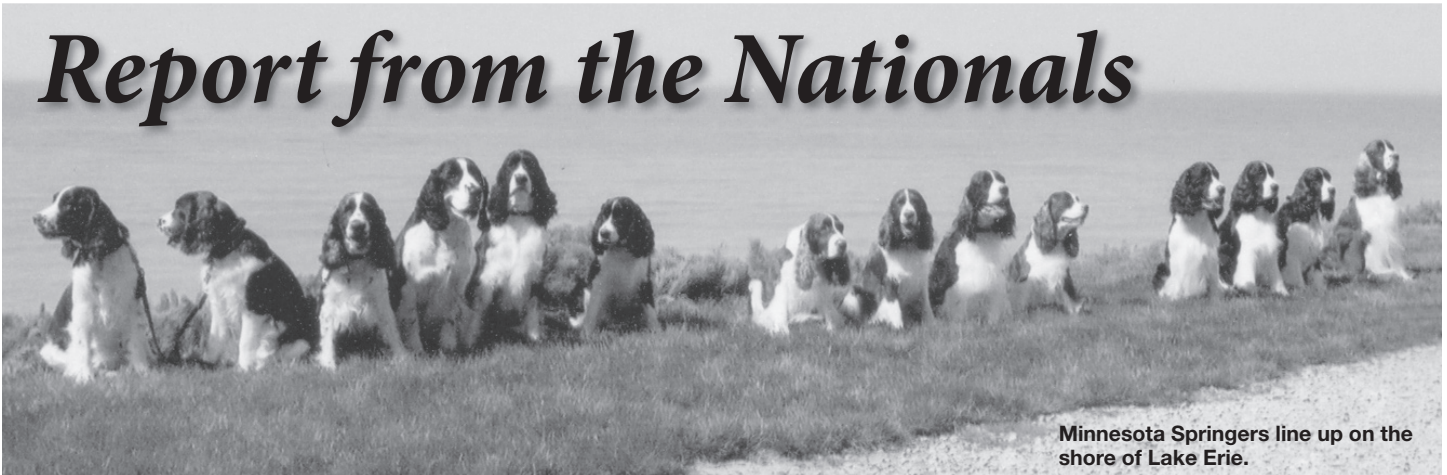
Minnesota Springers line up on the shore of Lake Erie.

The view at the 2005 Springer Nationals took your breath away. Not only for the beauty of the brand new lodge facility on the shores of Lake Erie, but for the bitter cold wind that blew off the lake during several rainy days of the ten-day event. It was enough to make even the hardy Minnesotans shiver, not to mention the poor souls from Florida who didn't think to bring a jacket. Bright blue, ESSFTA sweatshirts sold like hotcakes and there was a run on coffee from the hospitality room. Those couple of cold days aside, the 2005 National Springer event was wonderful.