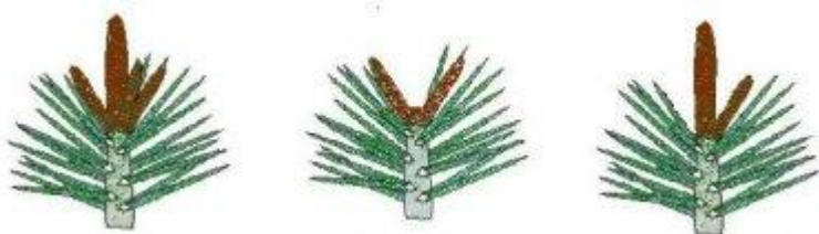
From Left to Right;

The development of foliage pads or branch structure on a bonsai dictates that the branch tips should fork and sub-divide into only two smaller sub-branches. As previously stated, Pine buds most often emerge in clusters or whorls at the end of branch tips. The basic rule in Bud Selection is to select two of the buds and remove the rest so that when the buds extend as shoots they form a two-pronged fork.