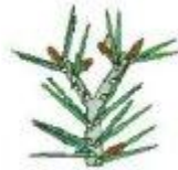
From left to right Image 1: Lower or inner shoot Image 2: Mid-level shoot Image 3: Upper or Outer shoot

As a basic rule leave less needle-pairs on the upper shoots and more on the weaker, lower and inner shoots. Often no needles are plucked from inner shoots to preserve their vigour. The actual numbers of needles that are removed will depend on the needs and strength of the tree. With a very vigorous tree it may be possible to leave as little as 4 pairs of needles on the upper branches, 6 or 7 pairs on the mid-level branches and 8-12 on the lower branches. Base your starting number on the lowest, weakest shoots since you can only decrease strength with this technique and not increase it. Do not remove so many needles that the overall vigour of the tree or branch is lost.