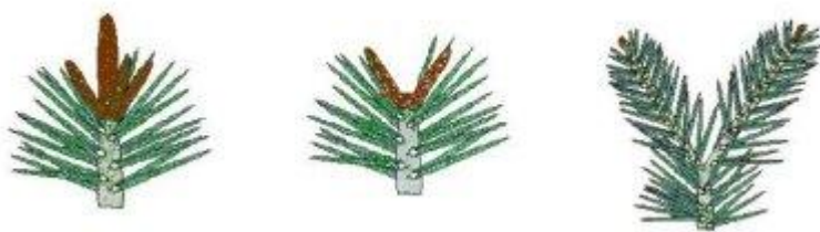
From left to right;

To encourage good branch structure and proper formation of foliage pads, whenever possible, buds that appear on the sides of a shoot should be retained rather than those than on top or below.