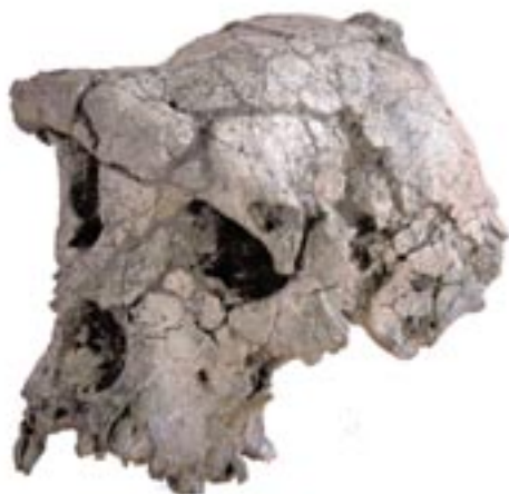
Figure 2. The recently discovered TM 266-01-060-1, seen here in 3/4 profile, shows the large brow ridges and relatively flat face. Note also the beginning of a small sagittal crest at the top (and back) of the skull.

The dental arch of TM 266-01-060-1 is narrow and U-shaped. 5 The preserved teeth are (on the right) I 2 alveolus (alveolus is a tooth socket in the jawbone), the distal part of the canine, P 3 -P 4 roots, fragmentary M 1 and M 2 , M 3 ; and