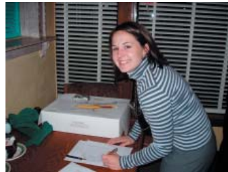
Aggies in North Central Florida were eager to sign the chapter's charter.