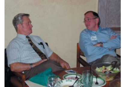
Aggies reminisced and “whooped” it up at the inaugural meeting.