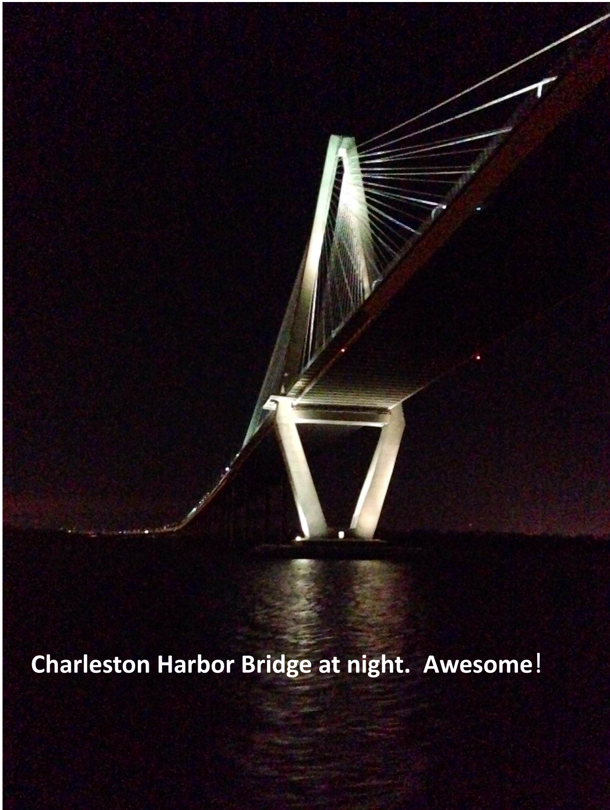
Charleston Harbor Bridge at night. Awesome!

Gas prices are down slightly from last year at this time. That's good news as they did not increase. The National average is $3.529. Regular ranges from a low of $3.13 in Billings MT to a high of $3.98 in CA . Diesel averages about $.45 a gallon more in most areas.