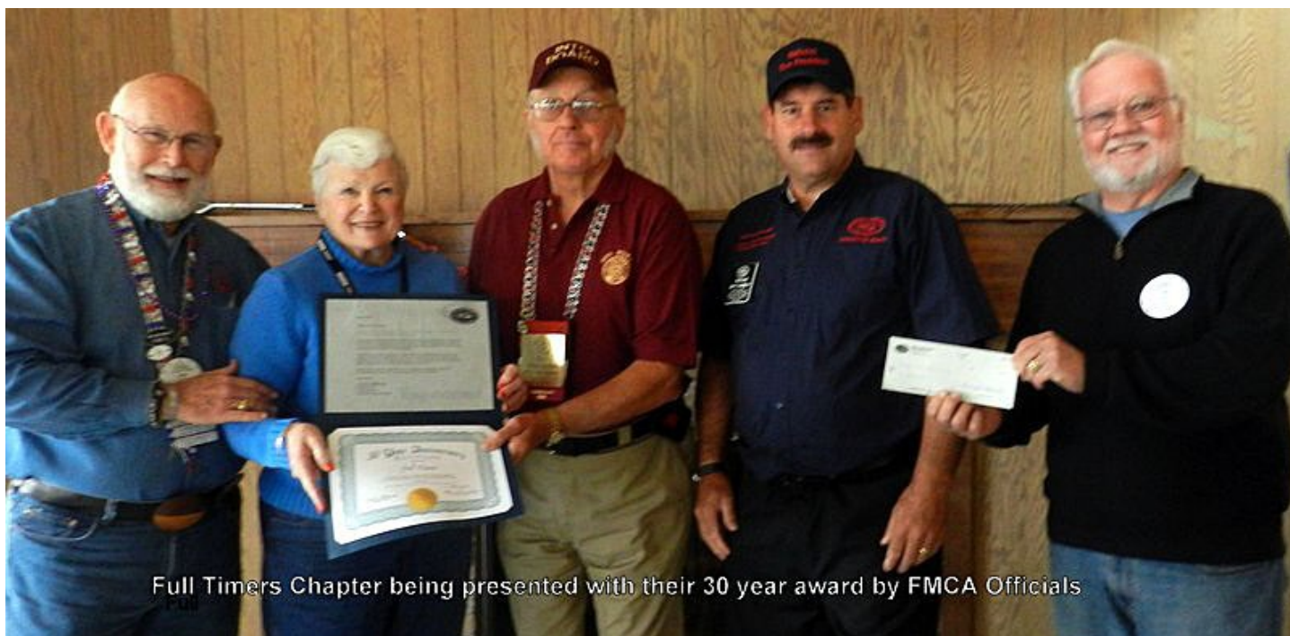
Full Timers Chapter being presented with their 30 year award by FMCA Officials