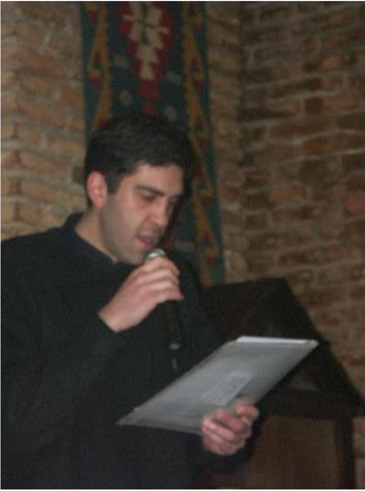
Givi Margvelashvili the Master of Ceremony!