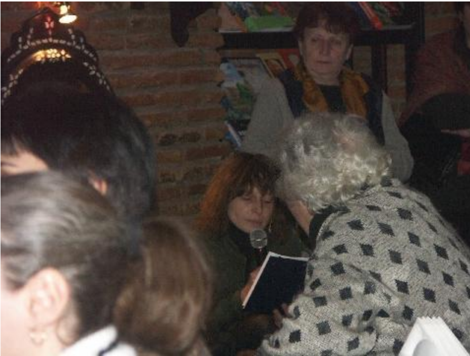
Nino Burduli, actress and intellectual