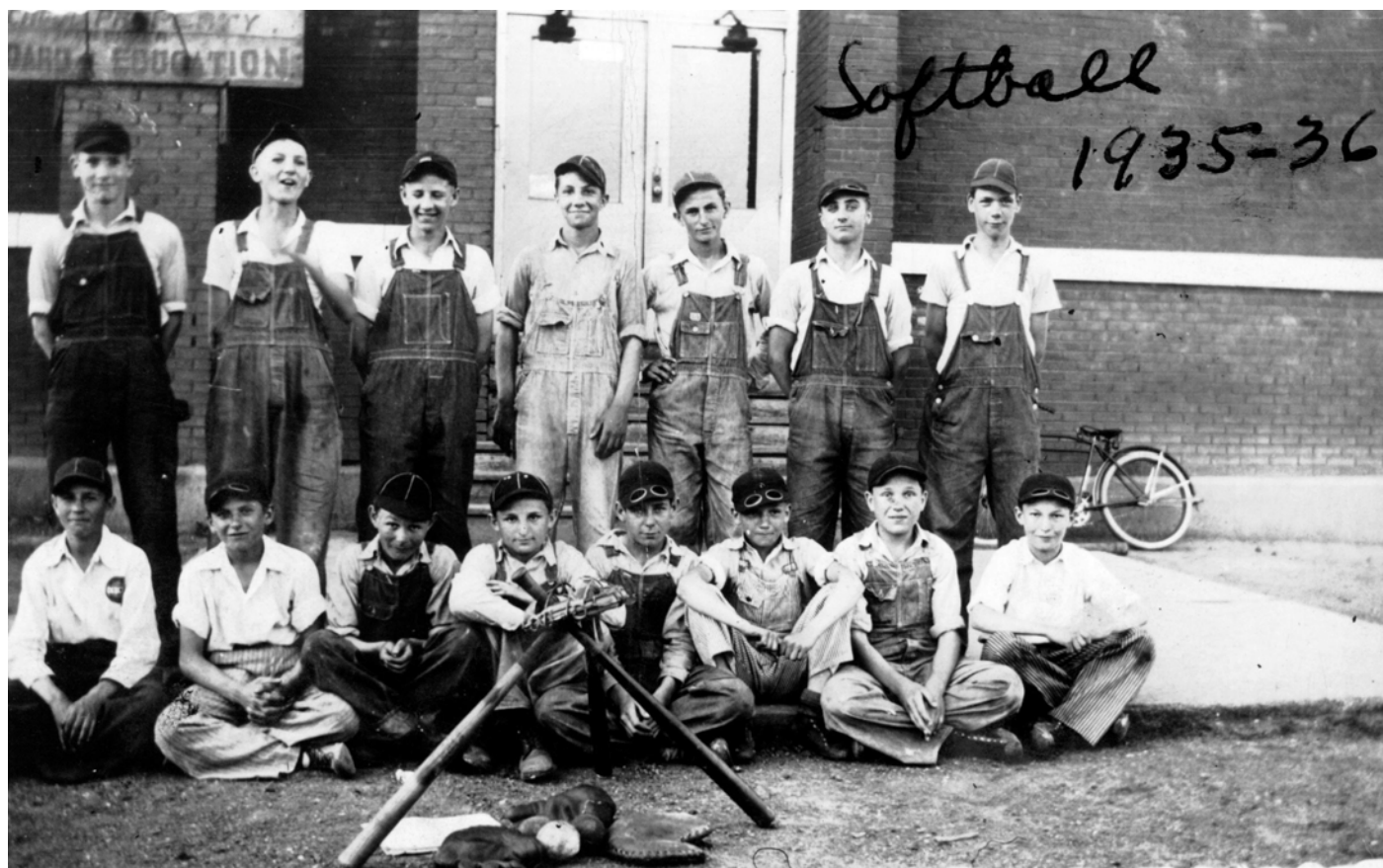
Softball 1935 - 1936