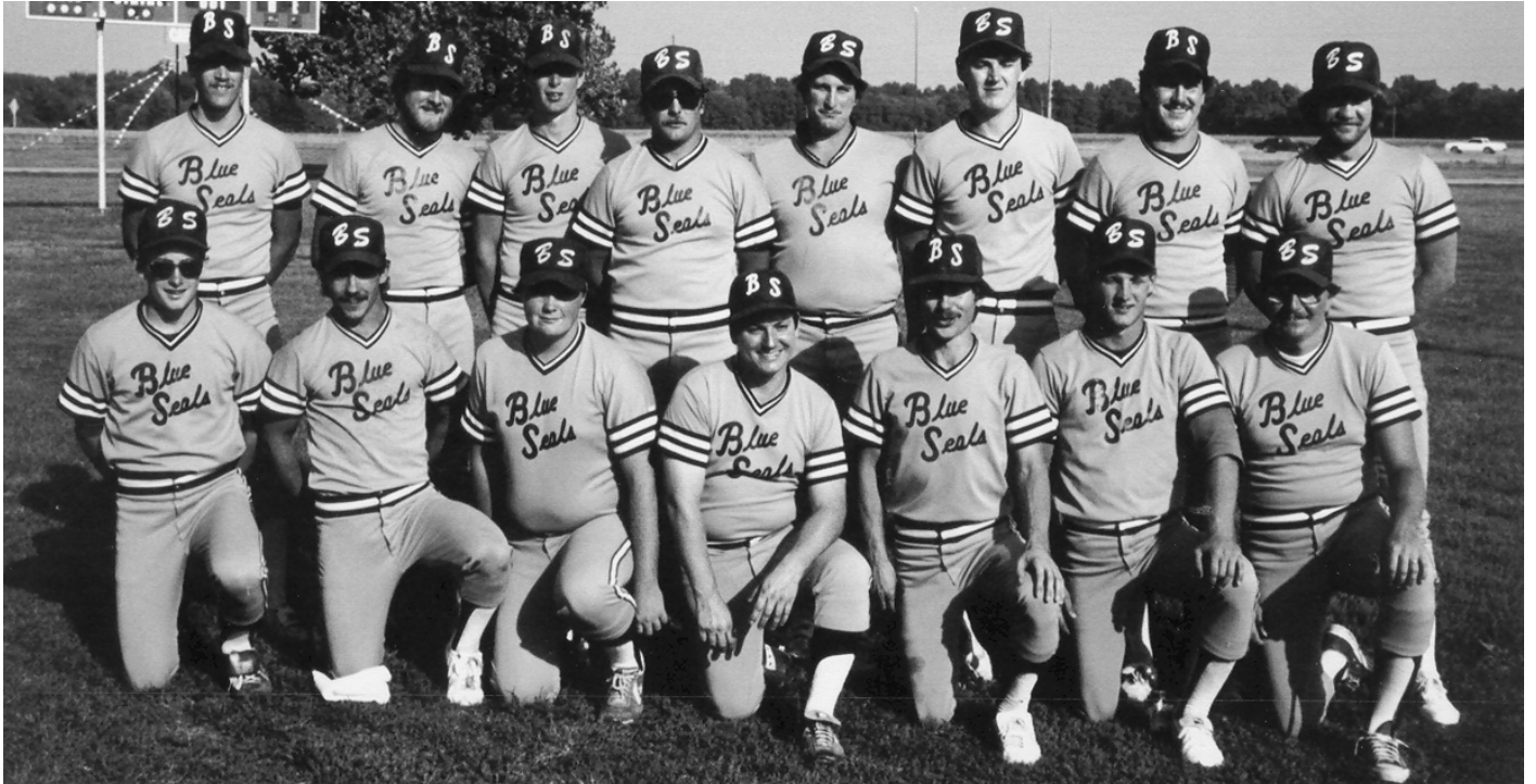
Livingston Blue Seals Baseball Club 1984