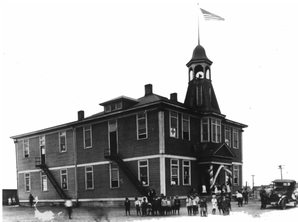
First grade school built in 1907. Addition was made to the building to accommodate increased student population. Note cross on white background hanging in upstairs windows. This represented rooms in which each child had given money for the Junior Red Cross.

The first school was a wooden building built in 1907. With the continued increase in population, it became necessary to enlarge the school which was completed in 1912. No one knows exactly how the increase of rooms to the school was made. Some of the pictures show a likelihood of an addition on the back.