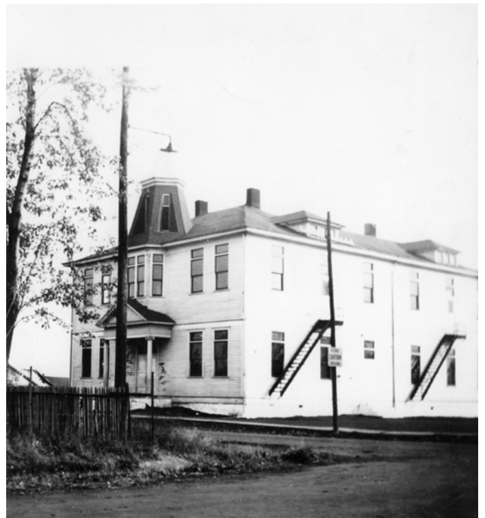
This is the same building after more renovations took place. Notice the difference in the bell tower from photo above.

It has also been noted that at the first school there was a large bell tower on the top of the building. This was topped by a flagpole from which flew Old Glory every day. The bell in the tower was rung every day as a signal for school to begin. The bell could be heard throughout the town. Some time later, according to pictures in the Madison County Historical Museum, the upper portion of the tower that housed the bell and supported the flag pole was removed. Even the