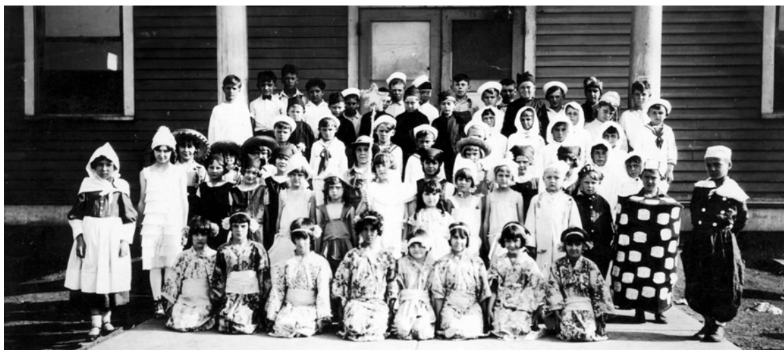
The Cruise of the Trundle Bed 1929 - 1930