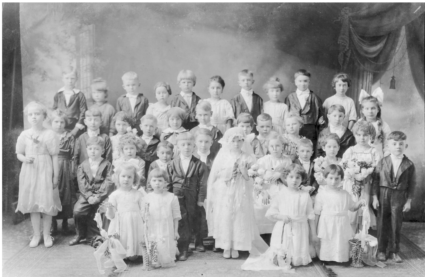
Thom Thumb's Wedding February 18, 1921