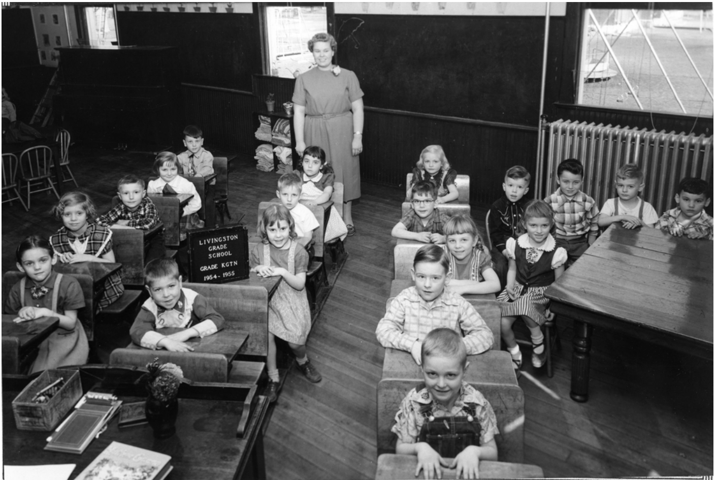
Livingston Grade School Kindergarten Class 1954-1955.

This building was used until 1961 when the new A.R. Graiff Grade School was built along Livingston Avenue. A great many young people went to this old frame building before it was torn down to make way for apartment buildings.