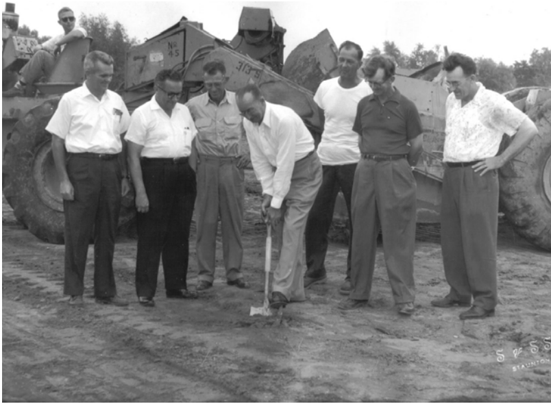
Ground breaking ceremony: