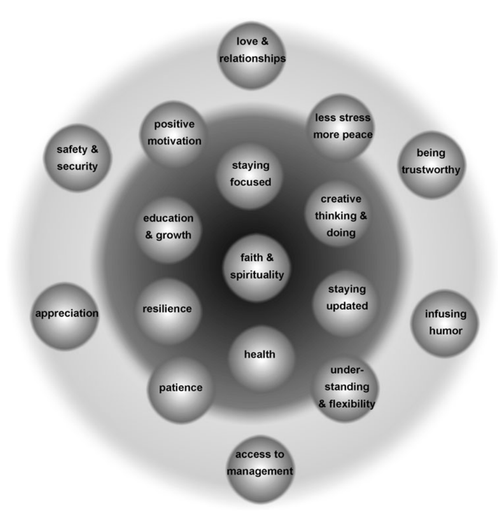
Figure 2. Inner-human and inter-human values that matter most in challenging times.

will be necessary to provide for America's future economic growth and broad-based opportunity. They mention action points such as, "helping people enter the labor force and rewarding their work; making the right long-term investments in our people; shoring up our social insurance programs; and increasing the progressivity of efficient tools like the tax code to share the gains of growth more broadly" (p. 30). It is not easy for managers today to guarantee worker's security, because of the volatile economic situation that brings unpleasant surprises for all of us. But while this need may not easily be fulfilled under the current circumstances, the fulfillment of another need may help workers cope with this issue: positive motivation. This should be done honest through communication and