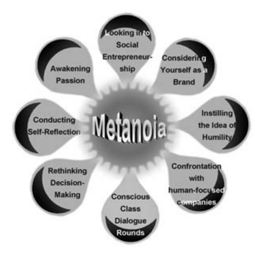
Figure 3: Course approaches to help induce a metanoia

This article provided a brief overview of some of today's main problems and a simple way to create a metanoia amongst those who will have to solve these problems: the current business student population. As Aseltine and Alletson (2006) put it: