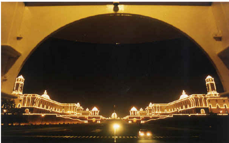
A FULL LIT VIEW OF THE PRESIDENT HOUSE