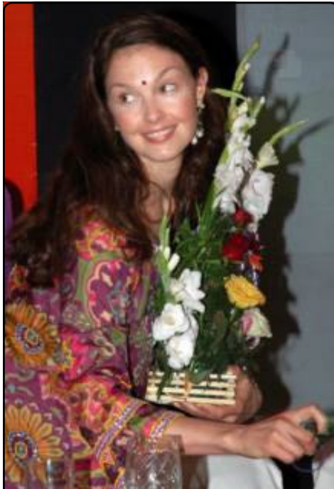
Hollywood Actress Ashley Judd at a Press conference in Jaipur.

NEW DELHI: India will contribute 1.53 million tonnes of food grains, the highest by a donor to be given for the SAARC Food Bank proposed by Bangladesh. The Bank aims at food and nutrition security of more than 150 crore people of the region. A meeting of Bangladesh's government chaired by Chief Adviser Dr Fakhruddin Ahmed took the decision this month. The food bank will start with a reserve of over 2 lakh 41, thousand tonnes of food grains.