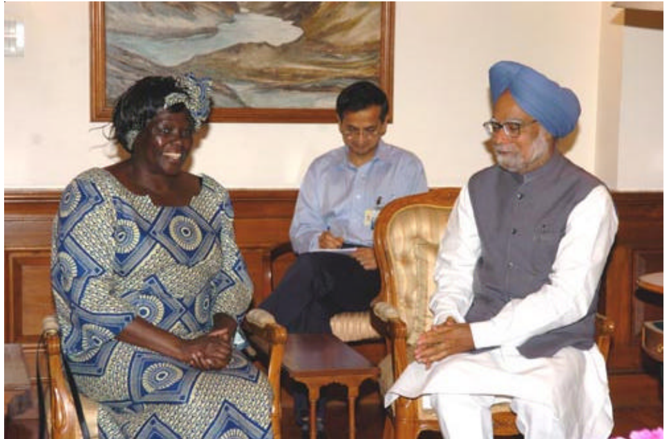
Prof. Wangari with Prime Minister Dr. Manmohan Singh

NEW DELHI: Kenyan Nobel Laureate Prof Wangari Muta Maathai has been conferred with the prestigious Jawaharlal Nehru Award for International Understanding for her outstanding contribution to environment conservation. President Dr. A P J Abdul Kalam presented the award for the year 2005 to Prof. Maathai at Rashtrapati Bhavan this month. She is the first African woman to receive the award