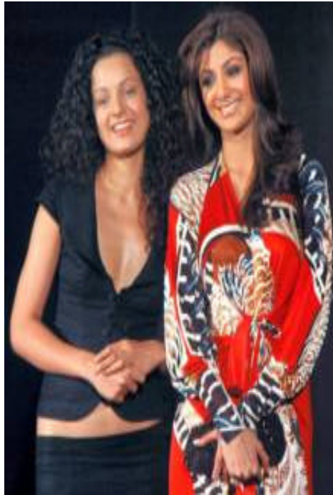
Bollywood actresses Shilpa Shetty and Kangana Ranaut at the music release of Anurag Basu in Mumbai.

NEWDELHI: The Vice President of India, Shri Bhairon Singh Shekawat said poverty is a blot on any civilized society. He said the Supreme Court has expanded the content and contour of the expression of life in our Constitution and ruled that the right to life implies the right to live with human dignity. This he said encompasses within its ambit, the bare necessities of life including health and sanitation, clothing and shelter, protection and preservation of environment free from pollution of air and water. He said, the State has the obligation to provide a decent standard of living to the indigent and downtrodden segments of our society. Shri Shekawat released the book "Poverty and