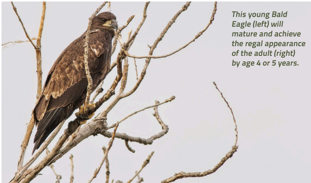
This young Bald Eagle (left) will mature and achieve the regal appearance of the adult (right) by age 4 or 5 years.