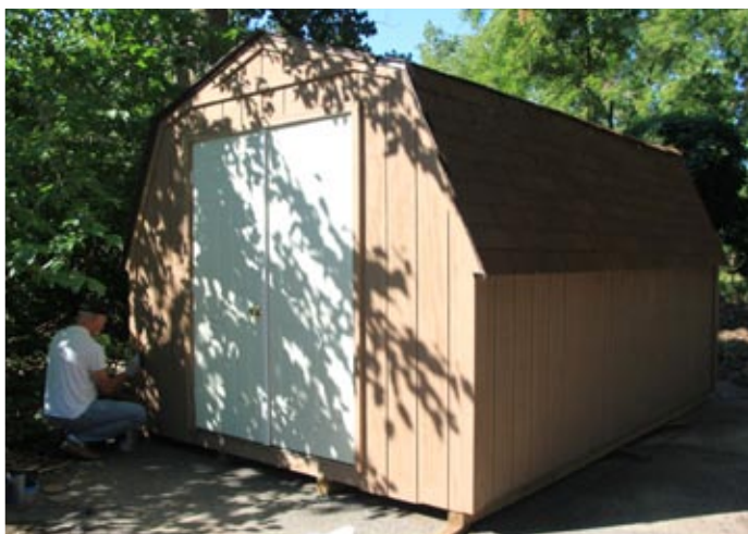
Dennis O'Brien painting the shed.

Everyone split up, with some spending their time putting the second coat of paint on the shed that had been provided by the US Fish and Wildlife group. It is anticipated, hopefully, that further painting will not be required for a minimum of 5 - 8 years. A great job was done, even though the tedious job of painting the grooves had to be done using a brush.