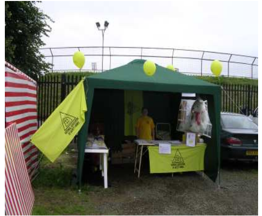
THE N.A.S.H Stand at the Ballymena Steam Traction Rally

Safety homes looks forward to returning next year, and we hope that you will call in and try your luck at some of the games and competitions that will be on offer.