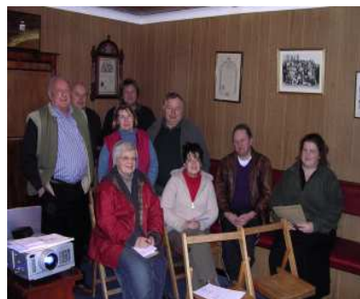
Moorfields community Association

Rural communities, often don't have the infrastructure that they need to develop; but with the dedication of those who join com-