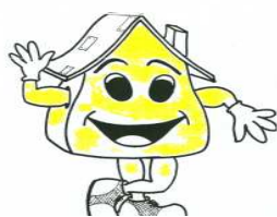
"Bung-I-low" N.A.S.H 's Mascot

The National Association of Safety homes is pleased to learn that the P.S.N.I 's Community Safety Branch, will assist us in preserving our integrity by ensuring that local community beat officers are kept informed when we, "sign up" new homes in their areas. Each home has its own unique reference number displayed on the exterior sign