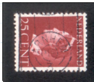
Arnhem 3 ('19) cancel on NVPH # 341

Another story is the “ARNHEM 3” roller cancel. This cancel (which by the way is the only Type VII roller cancel) is known only with '19 in it. Interesting enough, the cancelbook at the Museum for Communication in the Hague shows the cancel as ARNHEM 3 / '17 (not '19, or '15 as is shown on the actual cancel). The cancel was sent to Arnhem on December 10, 1917, and used at the Arnhem (Railway) Station.