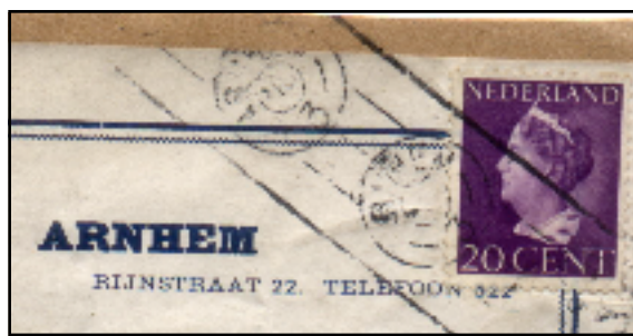
Arnhem 3 ('15?) detail of cover sent 3-17-1947

‘sGRAVENHAGE WO refers to the post office in the Wouwermanstraat in The Hague, which opened in 1924. On May 15, 1941 the ‘sGRAVENHAGE WO roller cancel was sent to the Wouwermanstraat sub-postoffice. This sub-postoffice facilitated an exhibition taking place from March through September 1941 in a nearby location. Why exactly they were using a roller cancel I have not been able to find out.