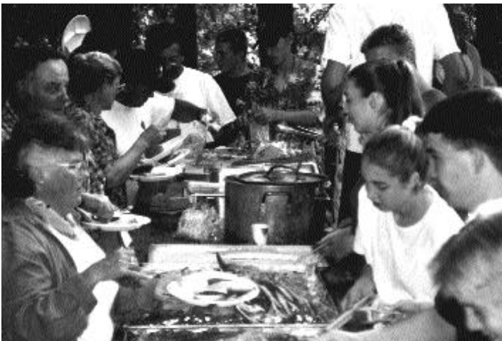
Three nights a week campers enjoy an outdoor barbecue. Other meals are served, family style, in the dining hall.

Do your own thing or join other campers.