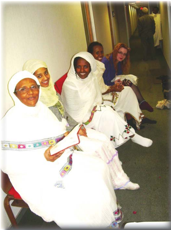
THE CHURCH WOMEN EXCITEDLY AWAIT THE START OF THE EASTER SERVICE ... AND THE END OF A LONG FAST.