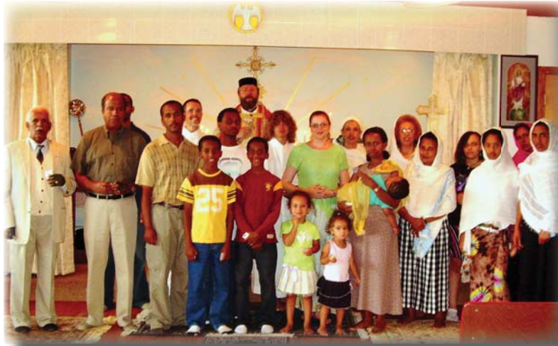
CHURCH PICNIC, 2006

In name of the Father and of the Son and of the Holy Spirit. Now and ever and forever. Amen.