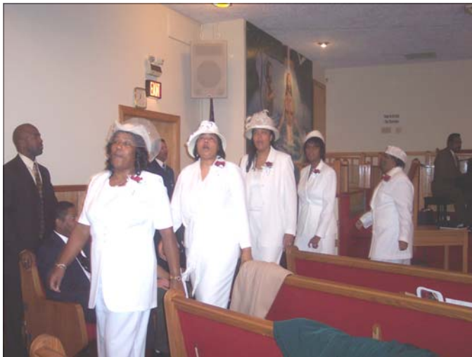
Missionaries in procession...

would keep us with a pure heart. Please keep the missionaries in your prayers as they continue to walk in the ways of God.