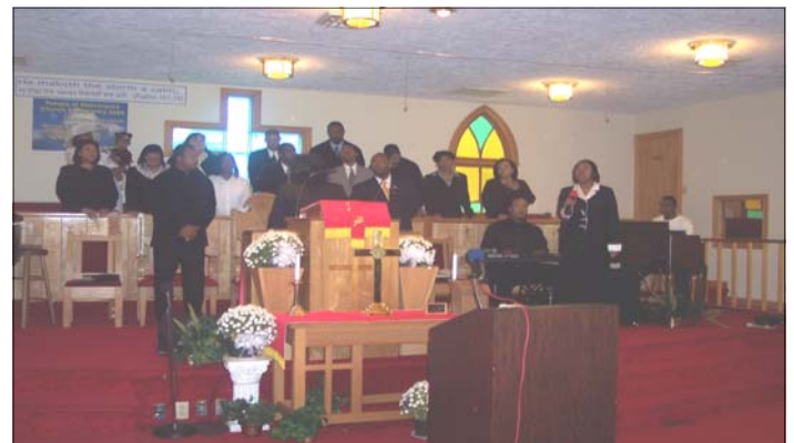
Young Adult Choir singing to the glory of God...

would keep us with a pure heart. Please keep the missionaries in your prayers as they continue to walk in the ways of God.