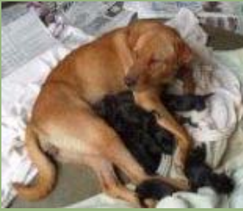
Sharpie gave birth to 12 puppies at our shelter after being rescued during a cruelty call. She is very sweet and outgoing and we currently have 8 of her gorgeous black puppies available for adoption.