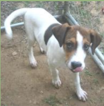
Heath was born 4/26/07. He is playful, crate trained, loves other dogs and is ready for his new home.

Fayette County Animal Rescue & Petsmart Presents