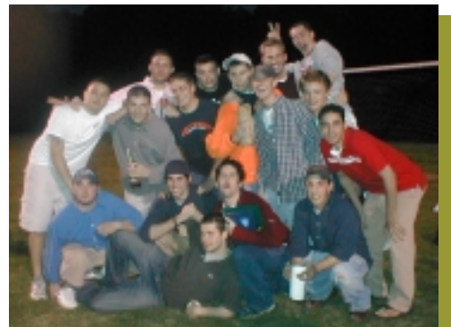
Softball Champion Sigs from the Iota Xi chapter at George Mason University