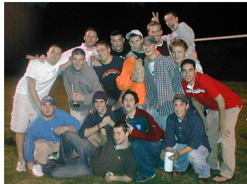
Softball Champion Sigs from the Iota Xi chapter at George Mason University