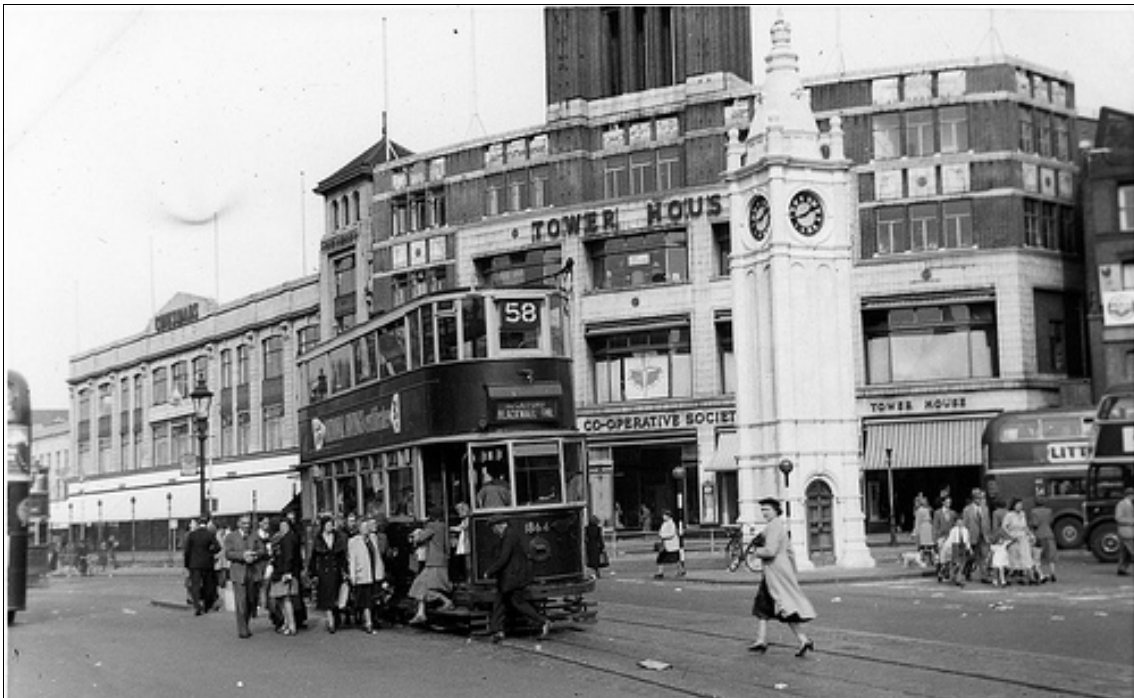
1940's Lewisham High St Chiesmans is the building on the left of the tram.

By 1959, Chiesmans Ltd had made a number of acquisitions which included a second department store in Maidstone, Kent; a branch store, which was later disposed of, in Canterbury, Kent; the Bon