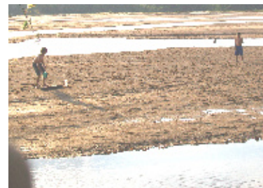
Ball game on the sands of the Shashi River

As we got out of the Land Rovers we saw the Shashi. We unpacked our luggage and then headed towards the large river which was about six hundred metres wide. Within minutes we were splashing away, playing games and having fun. We swam around catching fish.