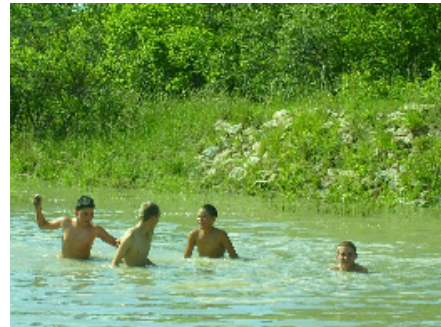
Playtime in the dam near Imadzi