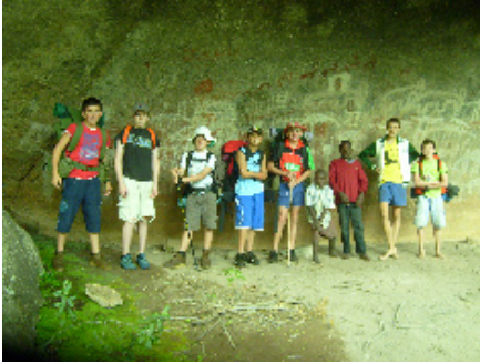
We are joined by two children from the Communal Lands in the Butterfly Cave.

We had our dinner and then went to bed. It was cold and without the trail sheet we would have got very wet. I kept waking up, freezing my nose off. When the sun came up, it got warmer. Clouds came over fast, so we ate our breakfast and set off. We followed the soggy paths and stopped off to see some cave paintings. My favourite was the one of a Kudu. We left again to Norman's favourite dam. It was spilling water and it was very full. But this offered only a short rest, as we soon set off again.