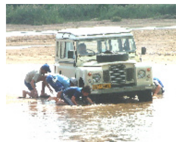
Ingulungundu sinks into the soft sand of the Shashi River on the return journey

We left the Shashi Wilderness Camp and went to the National Parks Office to ask their permission to cross the River into the Tuli Circle. We wanted to visit the Fort. The Warden said a National Parks Ranger would go with us. Then we set off towards the River. At first it looked as if we would not be able to get across. It was quite fun sitting on the front of the Land Rover. The water came up to the bumper of the Land Rover. When we came to the sandy parts of the River the Land Rovers could steer themselves in the deep tyre channels left by other vehicles.