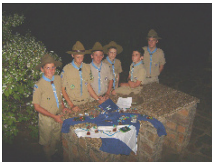
Admiring our gifts sent by the Scouts of the 12th Cork Scout Troop, Ireland.

The chance of being in the bush with their friends is so beneficial, as they learn to live with others at an early stage in life and to enjoy the best of their carefree youthful years. The opportunity for them to develop mentally and physically in a real life situation is worth more than any amount of instruction in the Troop Den. To me this is the wider aspect of Scouting, which is more important than merely "learning skills to progress" in their badge work. In this free environment, the skills they learn are meaningful. I have signed off tests on many a boy's progress card to his amazement and utterances that he has not sat in front of me to be tested. When I explain to him that he has passed the test by getting involved with the others and doing things right, there is no need for a formal test. This method of passing a test is less stressful and brings so much real joy to the boy. Besides instruction in the "run of the mill" skills of the Scout syllabus, they also have the opportunity of learning skills of a much wider range, in that of assisting me with the on-going development and maintenance programmes at the Park.