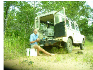
A final mug of coffee before heading for Zhugwe

As part of the Troop's One Hundredth Anniversary Celebrations which will be spread over the next two years, I intend to mount a few expeditions, so as to make our anniversary really special. Being by myself, I could now try a few ideas as to how best we could make an overnight camp that did not take long in setting up, nor too much trouble in striking. I have done many expeditions in the past with my former Troop and I had always found that providing shelter for the night stop could present problems. Having stopped off at Gordon Park on the way out to collect some additional equipment, I was now equipped to try an idea. I fixed a small tarpaulin to the roof at the back of Ingulungundu and using two long tent poles, a couple of guy-lines, I had a simply erected shelter. For a larger party, all I would need was a bigger tarpaulin.