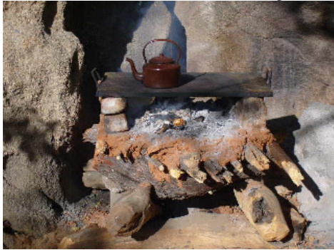
For the competition we made an 'altar' stove to cook on.

After breakfast, we really got on and made gadgets like, a washbasin stand, sleeping bag line, coat hangers for our uniforms, a shower in our campsite with hot water. We also built a step up to our kitchen area instead of having to negotiate our way around the stones. Just before lunchtime