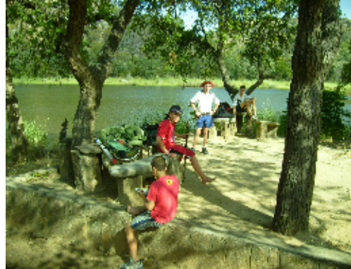
The picturesque Mwisilume Dam

It was not long before we reached the National Park game fence, which we crawled under and continued towards a large cave. The cave contained a few paintings by the San or Bushmen. We also surprised a klipspringer which, bounded away at our approach and watched a Black Eagle soar overhead clutching a small branch in one foot. From the top of a small kopje, Dale pointed out a windmill in the vlei below us. We re-crossed the fence back onto Big Cave Camp farm to have a look at the windmill and also to follow a track that led us across the vlei, which was overgrown with tall reeds. Once clear of the vlei, we re-crossed the game fence and found a very old path, which followed the vlei down stream. The bush was quite thick and we had to climb small kopjes to keep clear of the river. We eventually stumbled onto a vehicle track which we followed to reach Mwisilume dam. Here we had a short pit stop to empty our boots of the Matopos sand, sticks and stones.