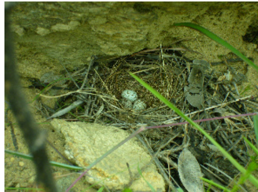
Christopher finds the eggs of the Striped Pipit in a nest tucked in close to a rock.

After a while Norm pointed out that the scenery was changing. We were now no longer in thick thorn tree country. The soil had changed from being reddish to a whitish grey. We were leaving the Bulawayo greenstone schists and had crossed over to the granite soils of the Matopos, hence the change in vegetation. There was also considerably more grassland. There were also some low granite kopjes and so we walked on using these kopjes as our reference points. Chris, who was in the front spotted a bird fly past (I didn't spot it). He then showed Norm and I a tiny birds nest on the ground, sheltered under a rock containing three tiny polka dotted eggs. Back at Gordon Park later that afternoon, Chris looked in Roberts Bird book and identified the bird he had seen as, a Striped Pipit. A few kilometres further we found another birds' nest, this time a Blue Waxbill flew out. Again there were eggs in the nest. We saw a small variety of animals on the hike, but my favourite moment was when Chris and I walked right passed a small shrub and then a yelp of surprise came from behind us. Norm had disturbed a scrub hare and the hare had bolted for fear of an old man and not of two teenagers who had passed it earlier. We passed six small dams, one of which was the checkpoint of the first leg of the hike and a second was the end check point. We nearly missed the last one as it had been breached and not much remained. Chris had completed his compass hike, and passed. Well done Chris.