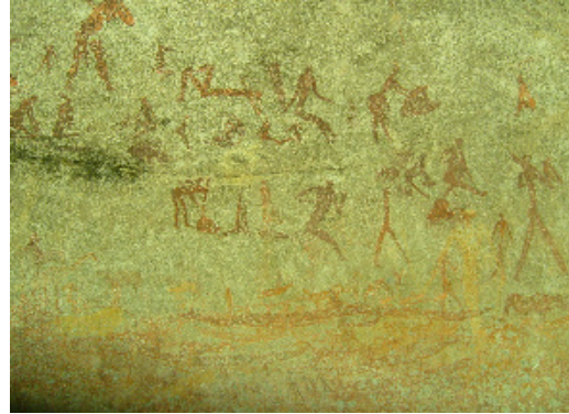
Spectacular examples of Rock art to be found in the Matopos

We hiked along in high spirits as we were pleased at having seen one of the three caves we had set as our objective for the hike. Silozwane is next to Silorswi, which is the highest kopje in the Matopos at three hundred metres from the valley floor to its summit and it was this kopje that we used as our beacon as we hiked for the next five kilometres. It did not take us long before we were close enough to see Silozwane with its cave quite high up on the south eastern side. The San paintings in the cave, a gigantic gapping hole in the solid granite of the kopje, are well known and are very well preserved. The view from inside the cave looking out onto the homesteads and fields of the rural folk is equally rewarding. The chatter and calling of the villagers, carried clearly up to our vantage point on the still air, as we ate guavas and roasted peanuts, given to us by Adam when we had left on our hike.