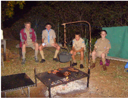
While the sausages sizzle.....