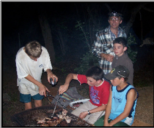
Everybody gets involved when it comes to preparing supper

After the arrival of the rest of the campers who had come out for the Parent's Camp, we arranged for all the necessary equipment to be loaded onto "Ingulungundu" and taken to the campsite. The camp was speedily erected and organized as required with everyone carrying out their duties and arranging their tents in preparation for the night ahead.